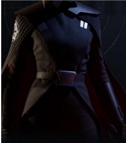
Second Sister Tunic