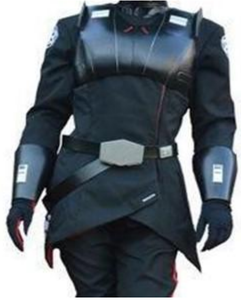
Seventh Sister Tunic